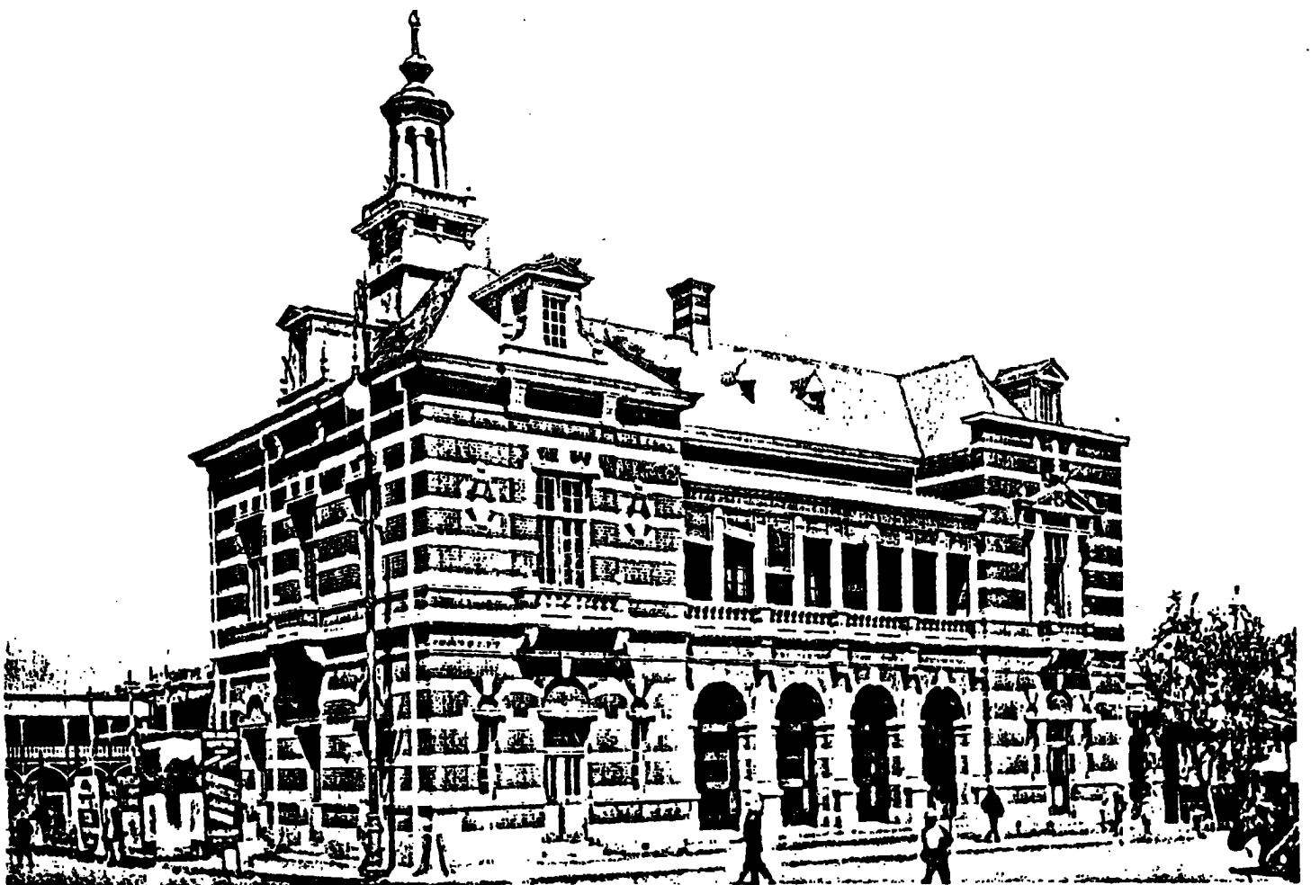
General Post office

This programme with the compliments of Adcock Ingram Consumer Division Distributors of Futuro Health Aids